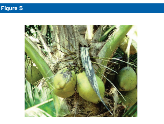
Green coconuts, the source of Cococin.

A sample formulation that incorporates the natural extracts described is presented. This Anti-aging cream formulation offers multiple functional benefits in smoothening, soothing, revitalizing and rejuvenating aging skin.