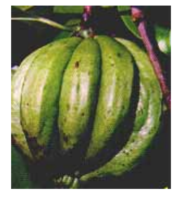
(Garcinia cambogia fruit)

The second extract is a patented natural composition from Garcinia cambogia (Malabar tamarind), trademarked GarCitrin<sup>®</sup>, containing hydroxycitric acid (HCA) and garcinol. Its primary purpose is for weight management support. The patented natural composition of bioactives from Garcinia cambogia is clinically proven to enhance lean body mass and support health body composition (Badmaev, et al; 2004). HCA is a well researched compound, clinically proven to support weight management.