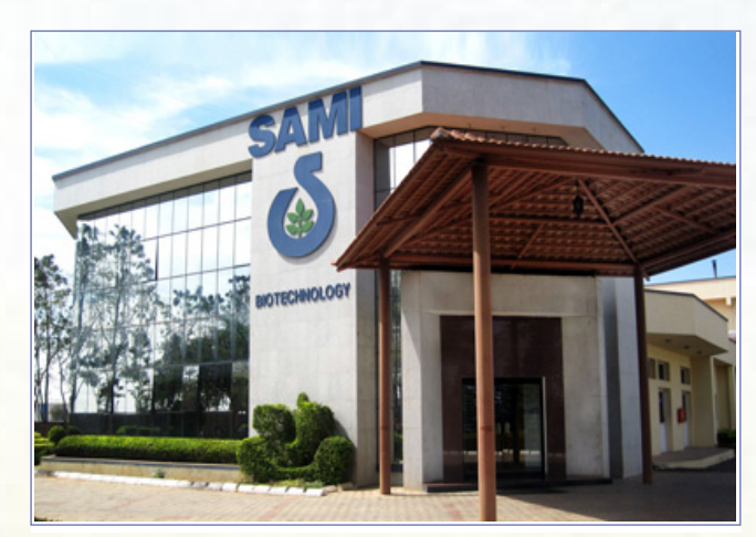
Figure 1 - SAMI (Sabinsa) FDA-inspected facility for production of LactoSpore® (Bangalore, India).

loss of viable count. B. coagulans does not require refrigeration conditions and is roomtemperature stable. Each batch of LactoSpore® produced in Sabinsa's FDAinspected biotechnology facility is inspected for sporulation and purity (Figure 1). The LactoSpore® powder produced in this facility is standardized to 15 billion spores per gram. Lower spore counts - e.g., 6 billion spores per gram – are also produced.