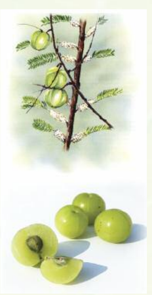
Amla (Emblica officinalis).

Sabinsa's Saberry extract scores high in