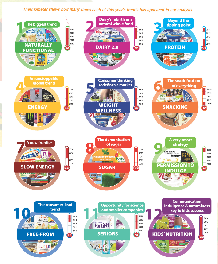
Figure 1 – 12 key trends in the business of food, nutrition and health.