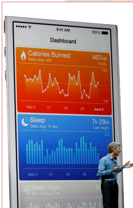
Health app dashboard on display. Ref: Apple, iPhone Conference 2014.

identified by New Nutrition Business , a leading publication from the Centre for Food & Health Studies based in London, key categories such as Naturally Functioning Protein and Energy all rank high.