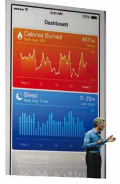
Health app dashboard on display. Ref: Apple, iPhone Conference 2014.

Figure 2. A healthy growth and a continued positive outlook for domestic and international markets.