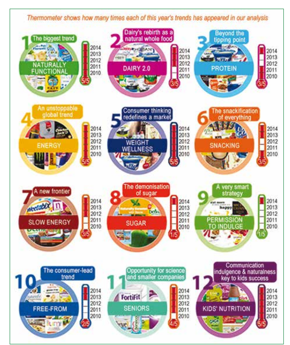
Figure 1. 12 key trends in the business of food, nutrition and health.

Of the leading 12 trends (Figure 1), identified by New Nutrition Business , a leading publication from the Centre for Food & Health Studies based in London, key categories such as Naturally Functioning,