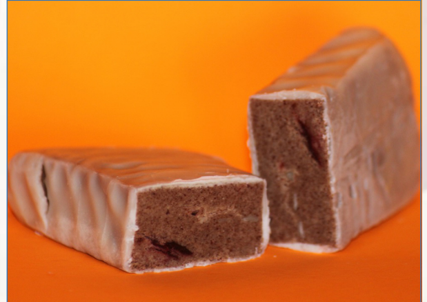
Figure 2 – Granola bar with LactoCran.

As a special synbiotic combination, LactoCran was added in a granola bar (Figure 2) for its potential health benefits. Granola is a breakfast food that consists of rolled out nuts, oats and honey. Value addition of probiotics to this nutritious breakfast meal with the addition of LactoCran helps to provide the probiotic benefits. Since LactoCran can be formulated in a variety of supplements as well, use of LactoCran in bulk protein powder providing the probiotic benefits as well as fiber to the gut will be of great interest. In recent times the role of probiotics in gut-brain-muscle axis has been much in focus as probiotic supplementation has produced benefits such as reduced frequency or duration of